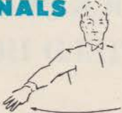
VIOLATION OF 3 SEC. RULE