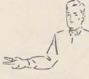
NUMBER OF FREE THROWS